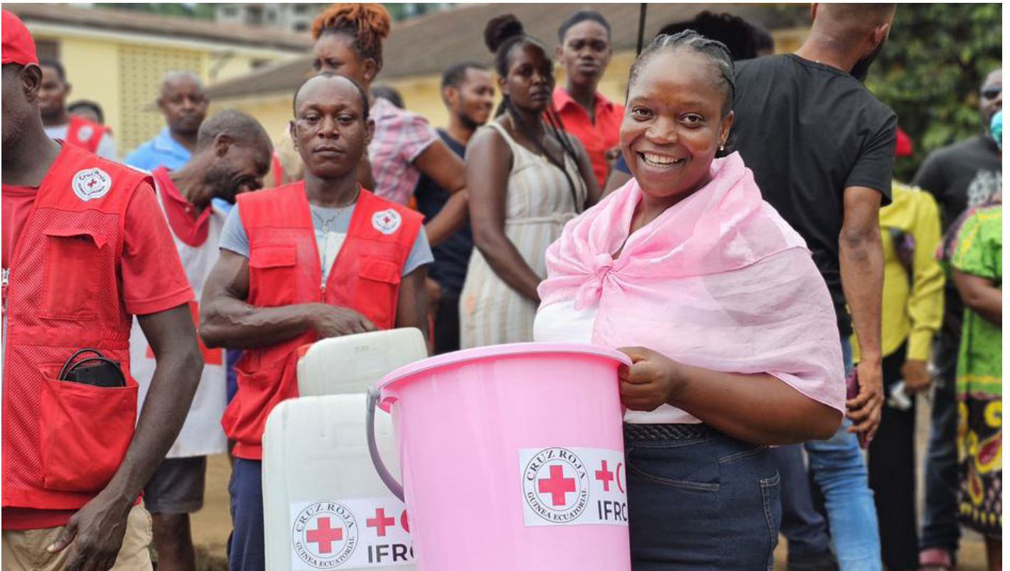
Following torrential rains, people affected received water, sanitation, and hygiene (WASH) kits from the Red Cross of Equatorial Guinea to support public health.

The IFRC provides both technical and financial support to the National Society in its interventions under health and wellbeing.